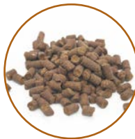
Corn Gluten Feed