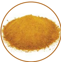
Corn Gluten Meal