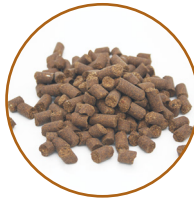
Corn Gluten Feed