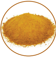
Corn Gluten Meal